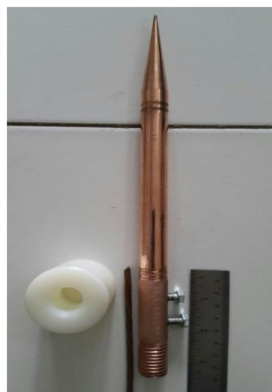
Splitzen As Tembaga 3/4 inch x 30cm