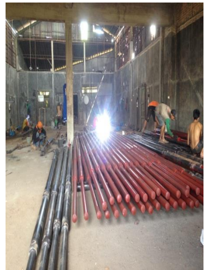
TIANG TELKOM 9 METER