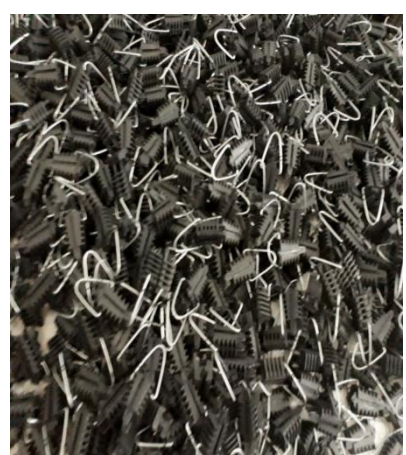
SWC (Tarikan Kabel)