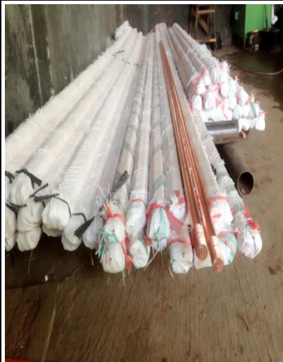
Grounding Copper Bonded 1 inch (Lapis Tembaga)