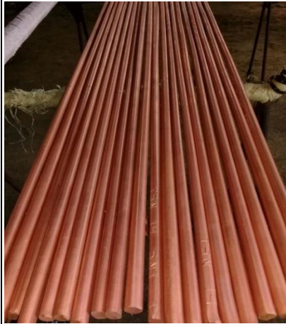
Grounding Besi Beton