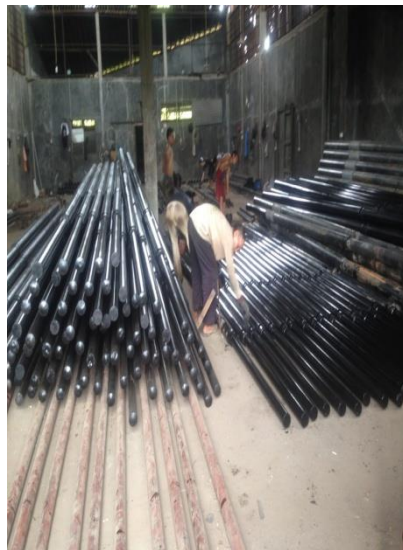
TIANG TELKOM 7 METER