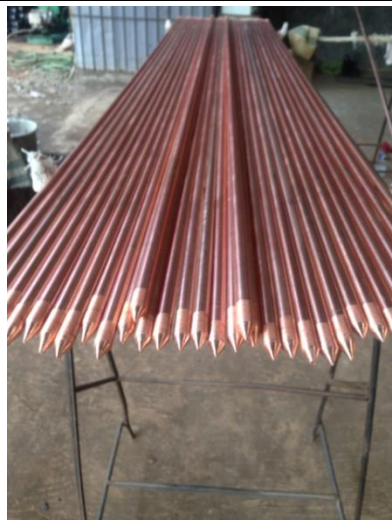
Grounding Copper Bonded 3/4 inch (Lapis Tembaga)