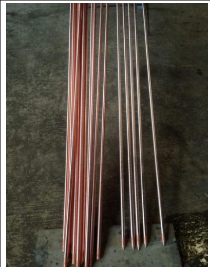
Grounding Copper Bonded 5/8 inch (Lapis Tembaga)