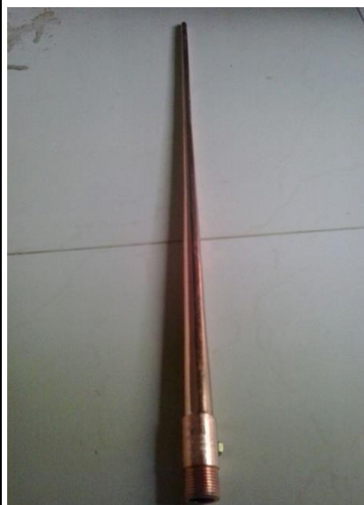
Splitzen Kuningan 1 inch x 60cm