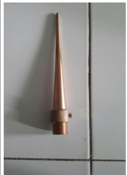
Splitzen Tembaga 3/4 inch x 30cm