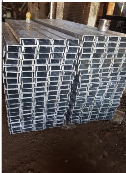
UNP / KARNAL