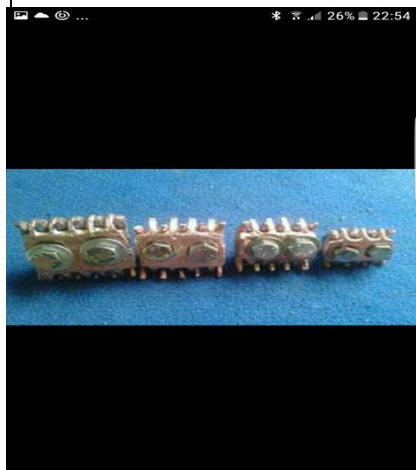
Clamp Unimax (Kuku Macan)