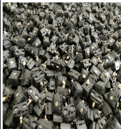
Tap Connector Baut 1